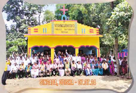
SINGADA, ODISHA - 07.07.24