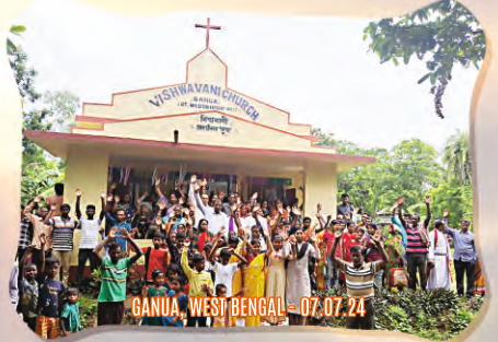
GANUA, WEST BENGAL - 07.07.24