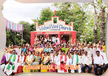
SIDAGAM VALASA, A.P. - 30.06.24