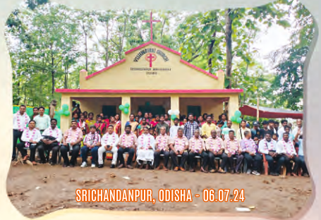
SRICHANDANPUR, ODISHA - 06.07.24