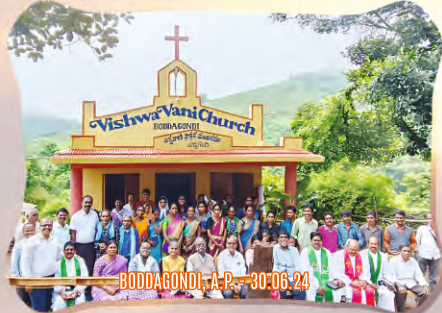
BODDAGONDI, A.P. - 30.06.24