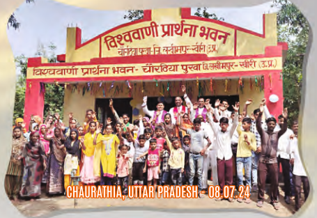
CHAURATHIA, UTTAR PRADESH - 08.07.24