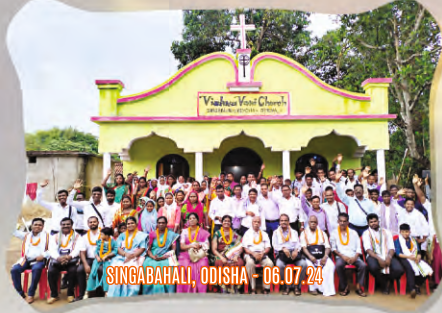
SINGABHALI, ODISHA - 06.07.24