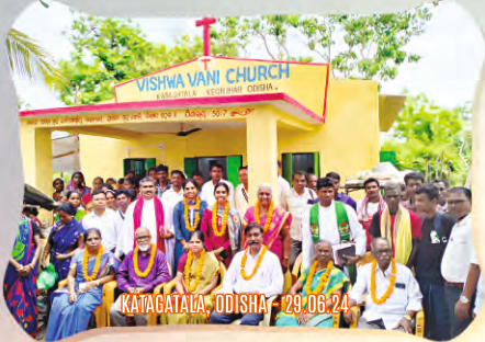
KATAGATALA, ODISHA - 29.06.24

The first-generation believers from Uttar Pradesh to Andhra Pradesh Worshipping in 17 new churches Arising, Shining and Reflecting Jesus Christ! Hallelujah!